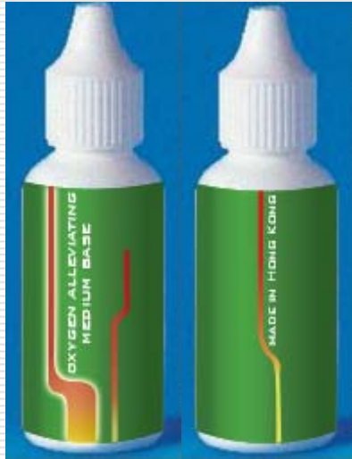
Cat. ABS 181-HA